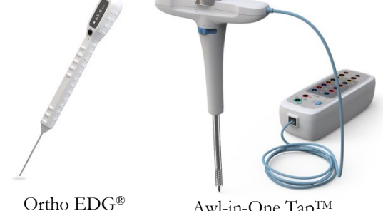
Ortho EDG<sup>(8)</sup> (for general ortho market) Awl-in-One Tap<sup>TM</sup> (for spine market)

Two recent studies illustrate the Ortho EDG® reduces major measurement error by 64% and 90%, respectively*, which can lead to ~$385M in savings/year.