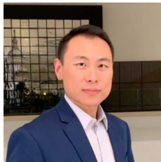
JET LU Customer Solutions Amazon Web Services